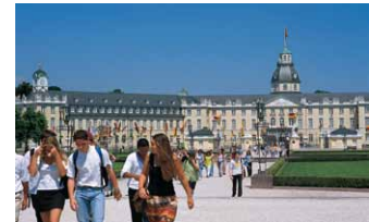
View of the beautiful castle of Karlsruhe in the middle of the city and also near by the university campus.